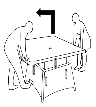
Stage 4 – Lower gently, ensuring that you are completely supporting the weight of the table top. Do not let the table top fall with force or it may damage the adjustable mechanism.